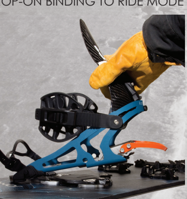
5 IT'S TIME TO RIDE!